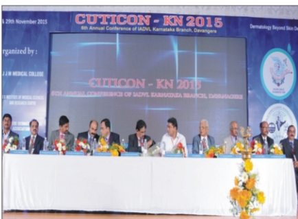
CUTICON - 2015