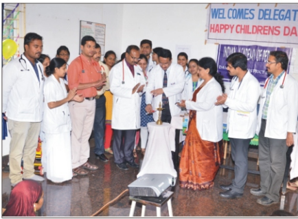
Childrens day celebrations