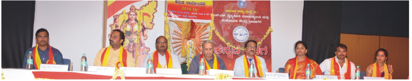
ಕನ್ನಡ ಬಳಗ Kannada Balaga