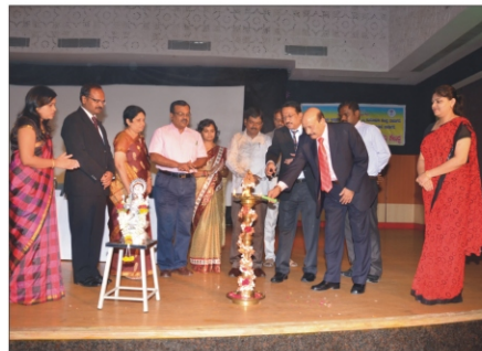
Community Medicine CME