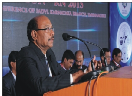
CUTICON - 2015