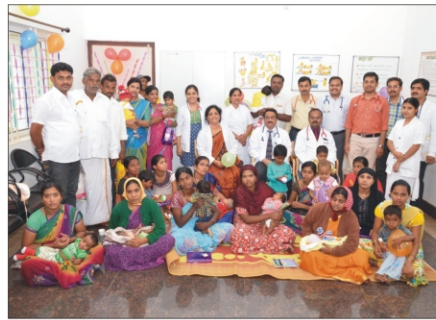
Childrens day celebrations