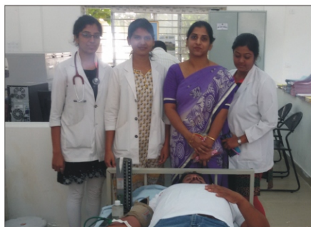
Tolhunse Blood camp