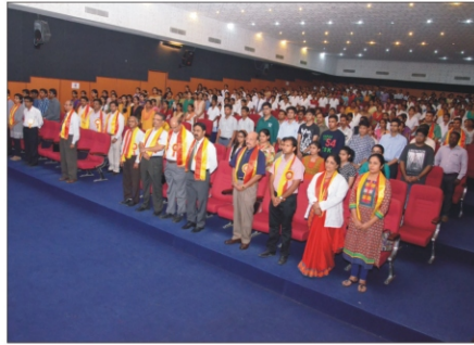
ಕನ್ನಡ ಬಳಗ Kannada Balaga