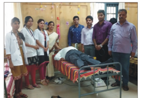
UBDT Blood camp