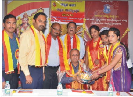
ಕನ್ನಡ ಬಳಗ Kannada Balaga