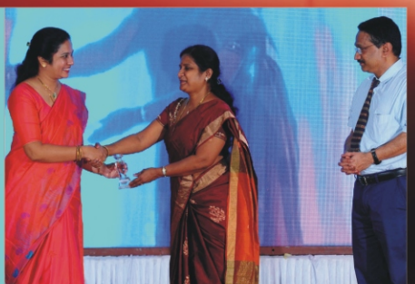
Sports Individual Champions